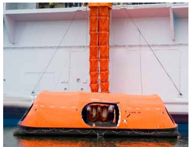
Largest capacity chute system available

The VEDC is constructed from two conjoined chutes. The fully enclosed chute lined with DuPont™ Kevlar® protects evacuees from environmental hazards, such as severe weather conditions, during descent directly into high capacity liferafts.